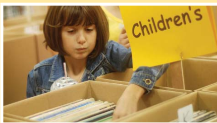
A young vinyl fan digs through albums in the children's section at the 2009 Classic Vinyl and Media Sale.

Are you cleaning out your closets or attic this summer? Would you like to contribute to a good cause that makes a difference in people's lives? Donate your old vinyl records, DVDs,