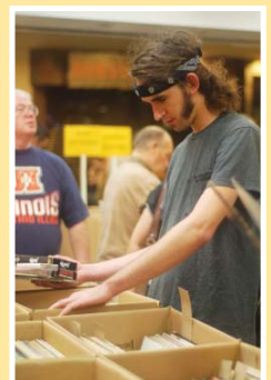
On the hunt for classic rock.

Vintage vinyl fans helped break a record at last year's sale by raising nearly $8,000 to support SIRIS.